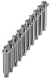
Fixed bridge, pitch: 9 mm, number of positions: 10, color: silver

Please be informed that the data shown in this PDF Document is generated from our Online Catalog. Please find the complete data in the user's documentation. Our General Terms of Use for Downloads are valid ( http://phoenixcontact.com/download )